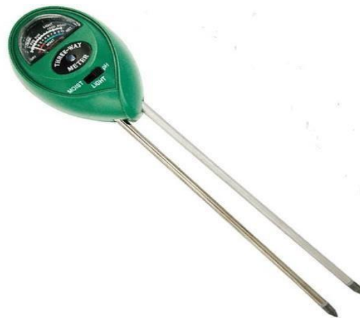
Fig. 5.1. pH Sensor