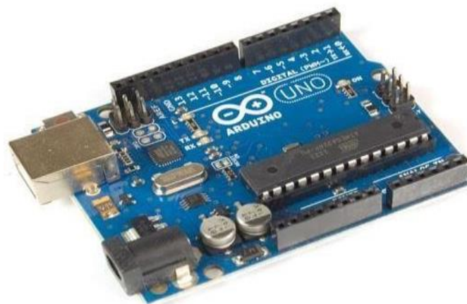
Fig. 3.1 - Arduino.cc Device

Arduino.cc's small controls summarize the new data in the boot-loader configuration database cipher with a processor-linked configuration. Special panels such as the Automatic Voltage Regulator of the chip containing the U-S-B of its In Circuit Serial Programming controller with I 2 C read / write pins. The standard Voltage Regulator is always a complex device for SRAM recognition and flash memory process as shown in Figure 3.1.