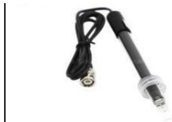
Fig. 6.2. TDS Sensors