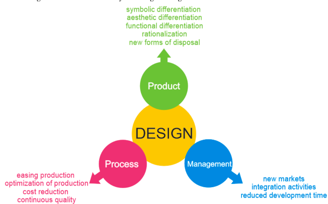
Figure 02: Levels of activity for design management.

From the perspective of developing new products, managing desing, according to Magalhães (1997) and Mozota et al. (2011), should manifest itself in three levels, as described in Figure 02.