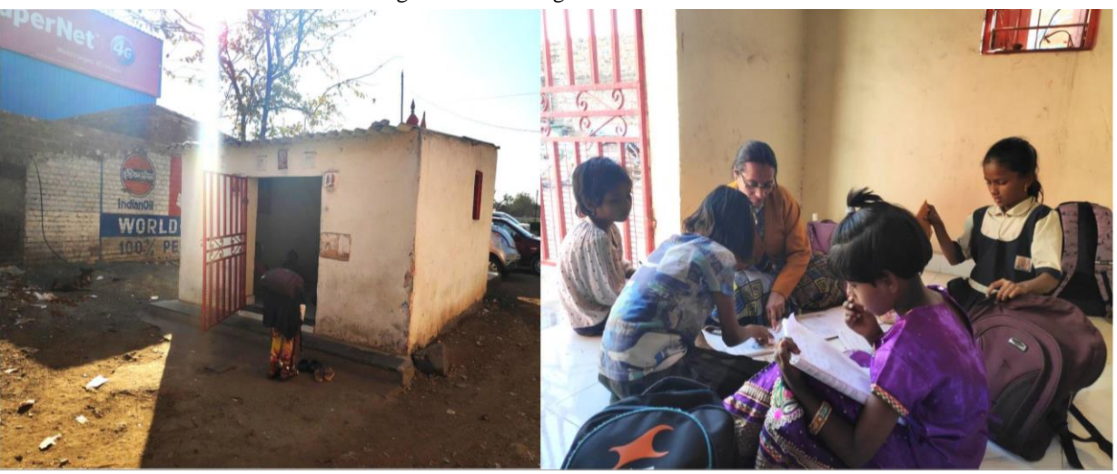
Figure 4 - Learning Center in Slum 3