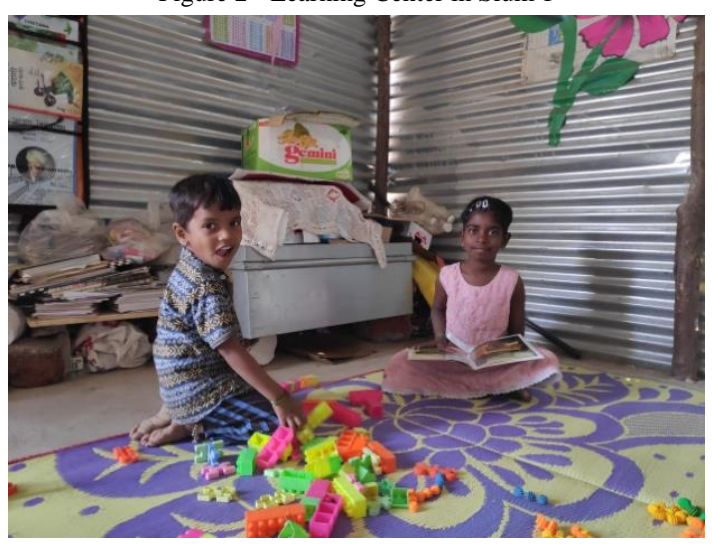
Figure 2 - Learning Center in Slum 1

morning and then attended the school in the afternoon. The kindergarten children attended the learning center at the slum. The learning center was a kutcha structure with timber frames and tin sheets. There was no electricity in this slum [15].