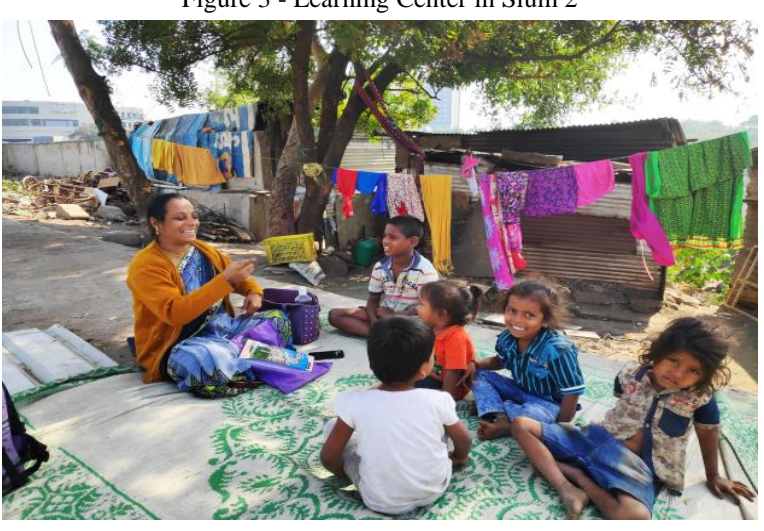
Figure 3 - Learning Center in Slum 2

school. The classes were conducted from 12:30 to 2:30 pm after the children came back from school. The children and the teacher sat under a tree on the plastic mat for learning as there was no structure or furniture [16]. The younger children were enrolled in schools in their villages, which they only visit once a year, which is the slum with the greatest number of young children. They were completely dependent on the NGO-run classes for their education; the older children travelled to the government.