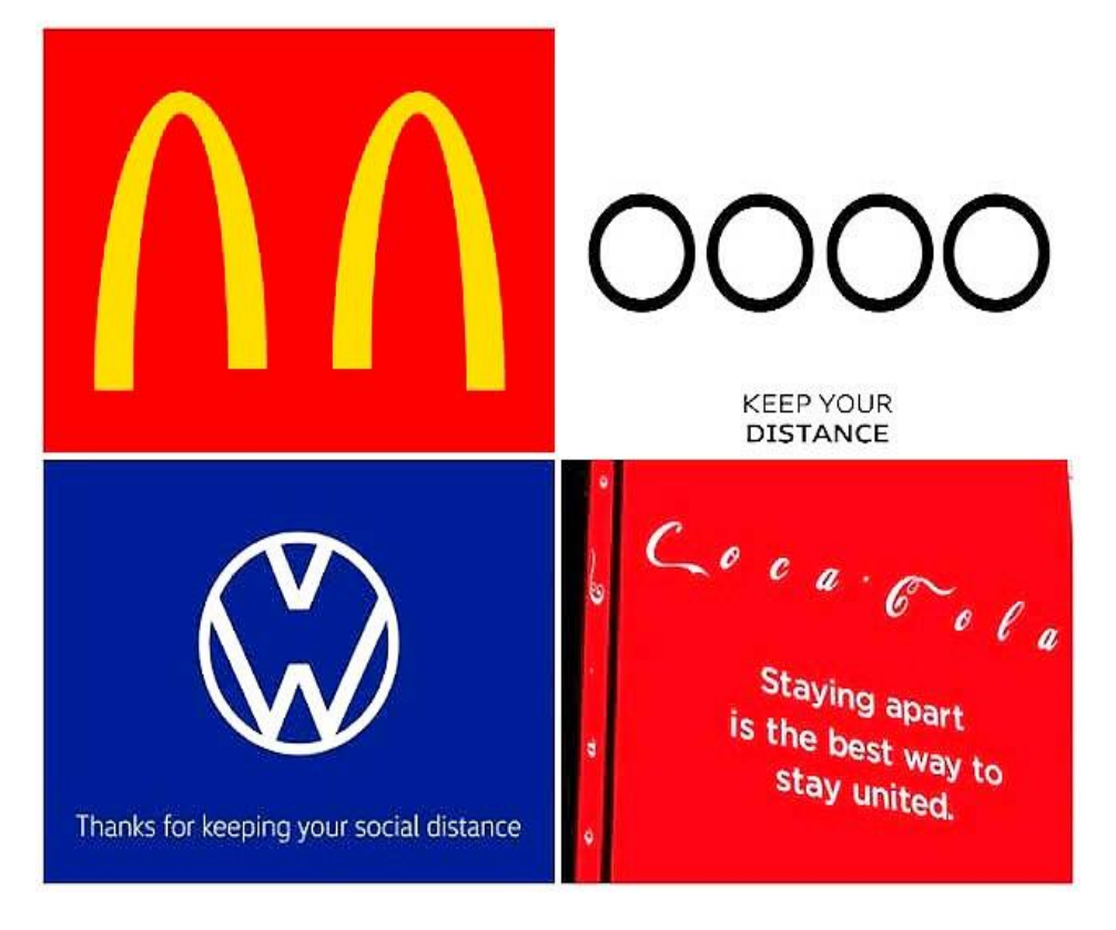
Figure 1 - Some examples of logo advertising by top brands during Covid-19 pandemic

Internal specialists will participate in the wider organisation via webinars and online workshops, and companies may utilise this opportunity to increase media-wide expertise, with a specific focus on digital technology, to facilitate better judgement. In view of the inevitability of consuming content, media policies should be reassessed This break may be used to solve lengthy issues about how to improve digitized services – in terms of expenditure, efficiency, and capacity.