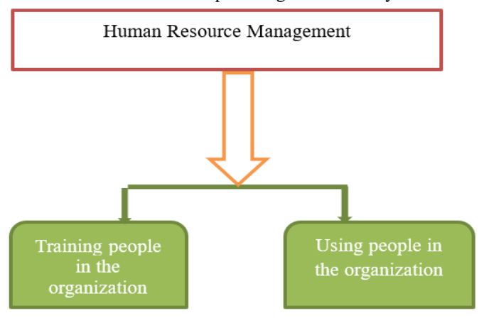
Figure 2 - Elements that make up the Digital University Administration