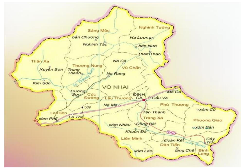
Map of Vo Nhai district (Thai Nguyen - Vietnam)