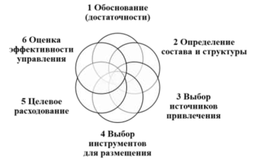
Figure 2- Components in the Algorithm of the Management of International Reserves